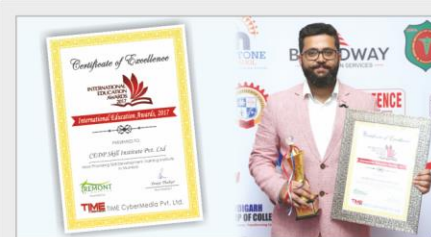
Awarded as The Most Promising Skill Development Training Institute in Mumbai at the International Education Awards 2018