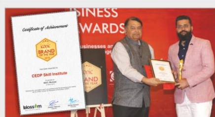
Awarded as Iconic Brand of the Year 2018