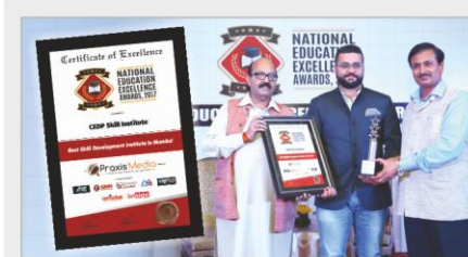
Won Best Skill Development Institute in Mumbai at National Education Excellence Awards, 2017