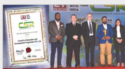
Awarded as BEST SKILL DEVELOPMENT INSTITUTION at ET Now CSR Leadership Award